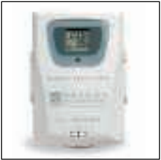
The equipment consists of the main unit and a sensor.