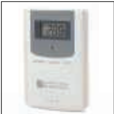
The equipment consists of the main unit and a sensor.

Not available in the UK - replacement model is the BAA 938HG/HGS