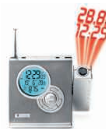
Projection of time and indoor temperature or alarm status