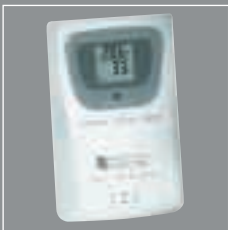
The equipment consists of the main unit and a sensor.