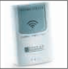
The equipment consists of the main unit and a sensor.