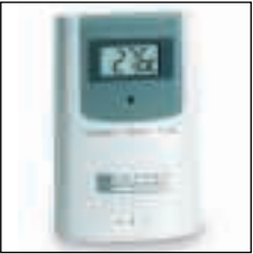
The equipment consists of the main unit and a sensor.