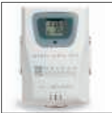
The equipment consists of the main unit and a sensor.