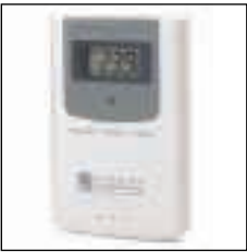
The equipment consists of the main unit and a sensor.