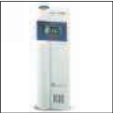
The equipment consists of the main unit and a sensor.