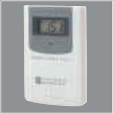
The equipment consists of the main unit and a sensor.