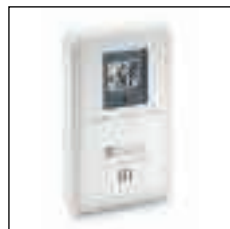
The equipment consists of the main unit and a thermo-hygro sensor.