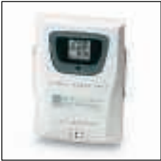
The equipment consists of the main unit and a sensor.