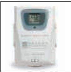
The equipment consists of the main unit and a sensor.